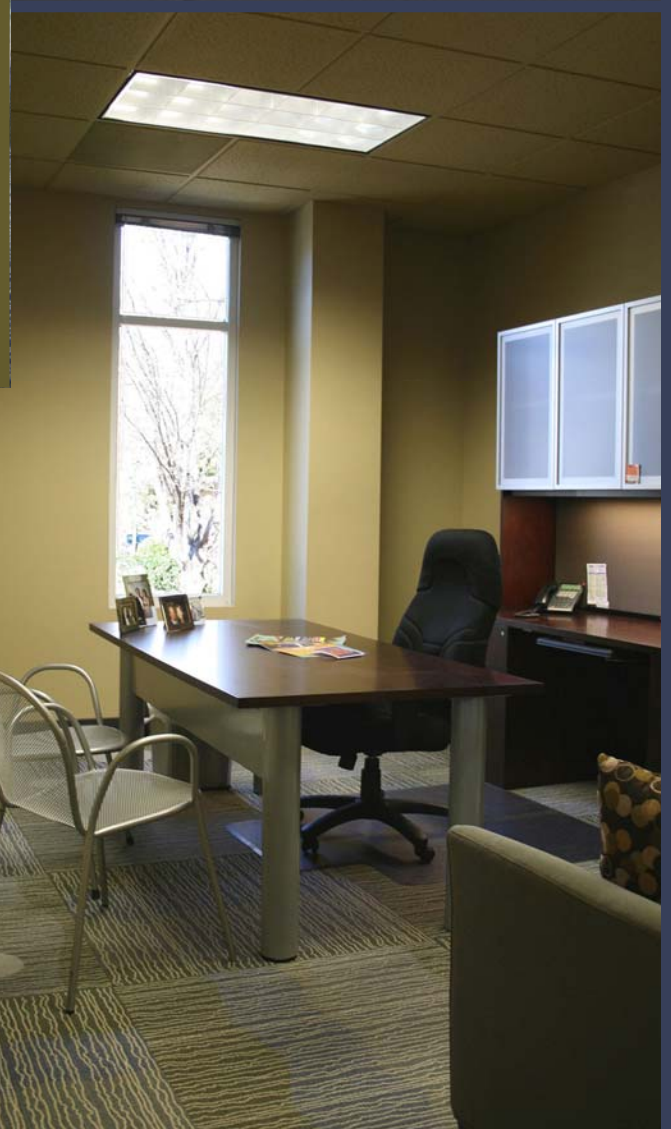
Executive Suite Space