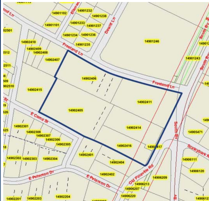
Local Site Map